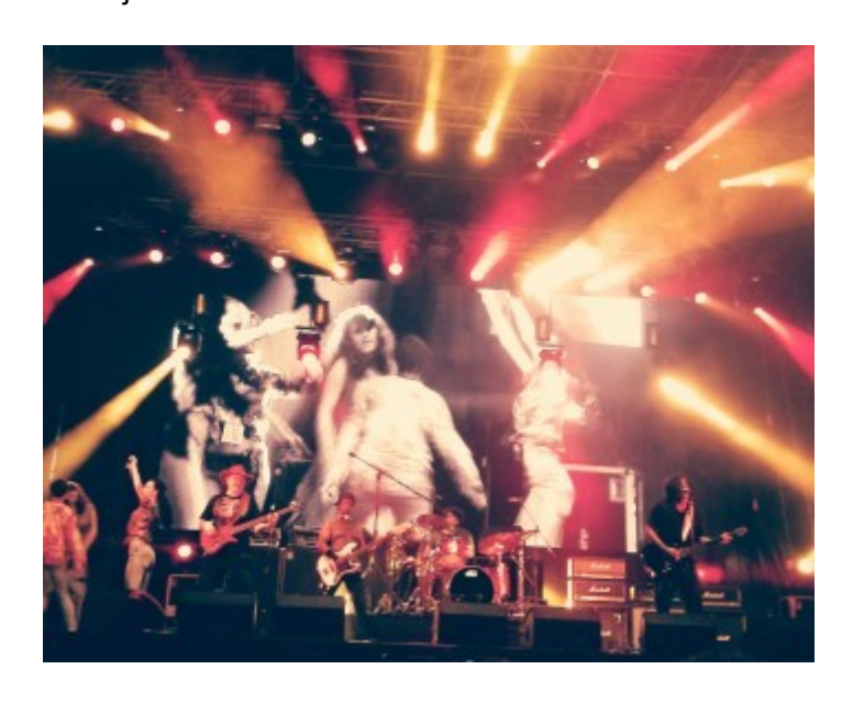
Stevie Salas Colorcode live in Europe