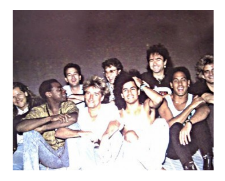
Rod Stewart Band 1988