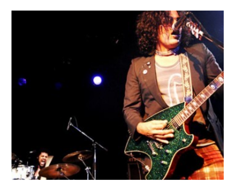
Stevie Salas Colorcode live in Tokyo 1997